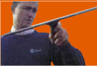
Window Cleaning POA