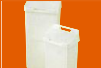
Female Hygiene Disposal From £3.50 per week