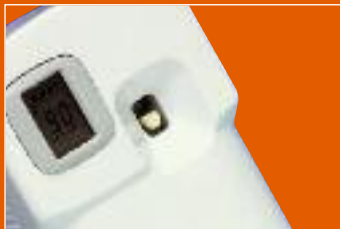
Odour Control System £38.63 each