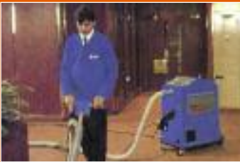
Carpet Cleaning POA